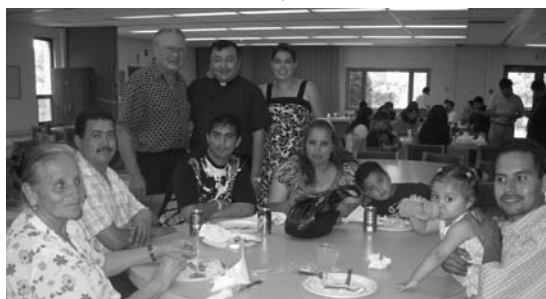
See page 3 for more photos!