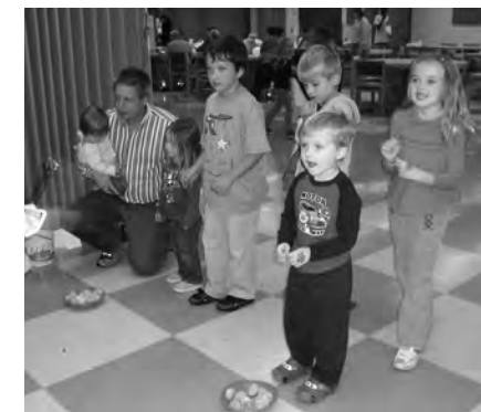
Kids used Robot Arms (kitchen tongs) to transport moon rocks in the Moon Rock Relay Race.

Everyone had a great time at Family Movie Night on Friday, October 17th. Children played games and made crafts before the movie, then settled down on blankets and pillows to watch 3,2,1, Penguins Save the Planets. Special thanks to all the middle and high school volunteers who made this fun event possible. ❖