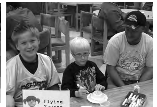
The Williams boys work on designing flying saucers.