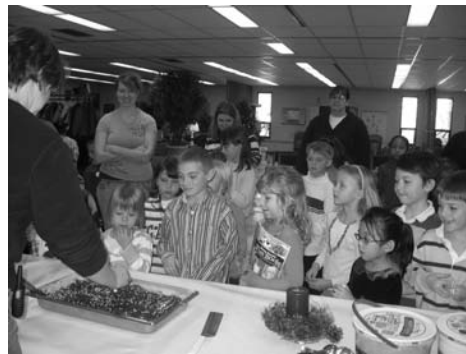
Students wait anxiously for the candles to be lit so they can sing Happy Birthday.

for women with unplanned pregnancies. Both parties ended with birthday cake and ice cream. ❖