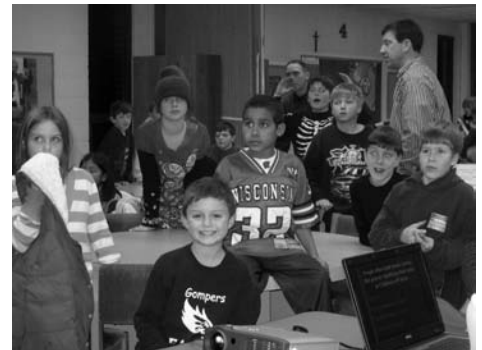
Students work together to come up with the right Jeopardy question.